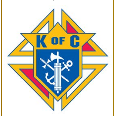
In Service to One. In Service to All

Knights of Co1umbus 180 S. Russell Ave Aurora, IL 60506